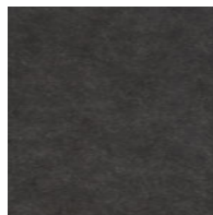
SURESTEP STONE BLACK CONCRETE Code BAUDET 951