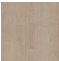
SURESTEP WOOD ELEGANT OAK Code BAUDET 870

*The floor finish is white out of the vinyl floor